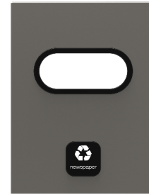
4" x 10" Slot Opening