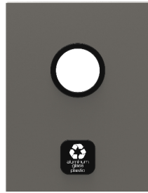
5in Hole Opening