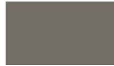
Urbidermis Light Grey