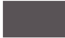
Urbidermis Dark Grey (LF Dusk)