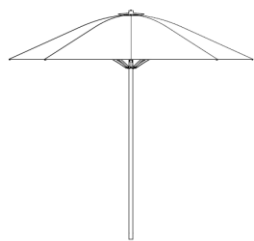
Umbrella, plain edge