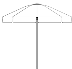
Umbrella with valance