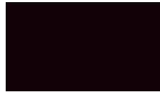
BLK (Gloss Black)