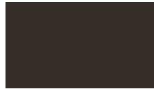
MBK (Matte Black)